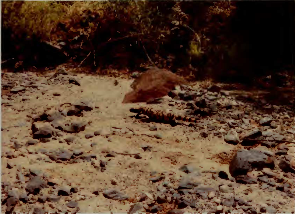
Fig. 5. The Gila monster from Piute Springs (Fort Piute), San Bernardino County, California. LACMPC #1364a.

tons are part of a chain of sky islands with elevations exceeding 2,200 m. The first specimen was sighted, and photographed (Figures 6 and 7), 5.5 km east-northeast of Horse Thief Springs (elevation 945 m) on 4 May, 1980, and is the only documented Gila monster from Inyo County. The second was sighted 1.4 km west of Porcupine Tanks at 1,220 m on 20 May, 1980. The third was seen 2.6 km west of Kingston Peak at 1,130 m on 3 June, 1980. All three occurred in sandy washes associated with large boulders. Plant species in the area included catclaw acacia ( Acacia greggii ), burrobush ( Ambrosia dumosa ), Death Valley ephedra ( Ephedra funerea ), creosote bush ( Larrea tridentata ), and desert almond ( Prunus fasciculata ) (Ford 1981).